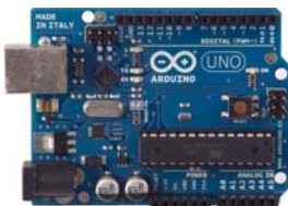
Arduino Uno R2 Front