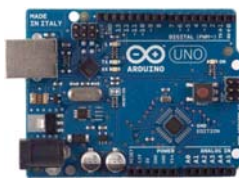
Arduino Uno SMD