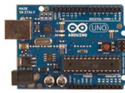
Arduino Uno Front