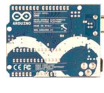
Arduino Uno Back